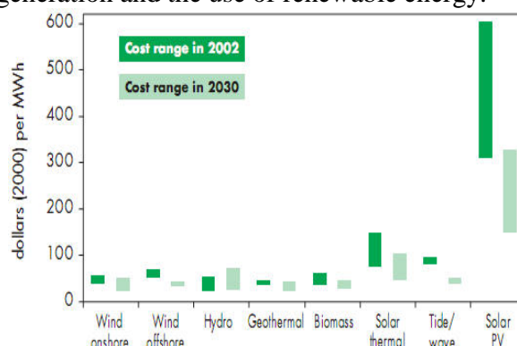
Figure 01: Electricity-Generating Costs of Renewable Energy Technologies, 2002 and 2030

1- The cost of Fuel Energy production compared to fossil energy: The cost of renewable energy production through different technologies is illustrated in the following figure. It is necessary, before evaluating the costs, to comprehend the use of this renewable energy, as well as areas in which it is supposed to be used. Is it a distant and an isolated place, or an area within a city? The daily operating time should also be known, besides the need to save energy, and the necessity for maintenance. It is well known that most Arab countries subsidize prices of electricity produced from oil sources. So, these subsidies should be taken into account when comparing the cost of electricity generation and the use of renewable energy.